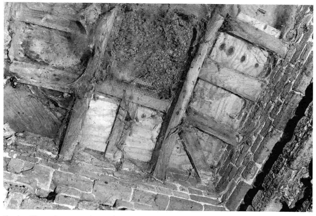
Fig. 5 – The roof structure from below, showing the rectangular aperture through which the pigeons formerly entered.