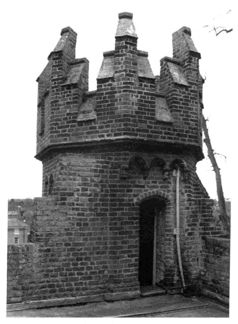
FIG. 2 – The dovecote from the east.