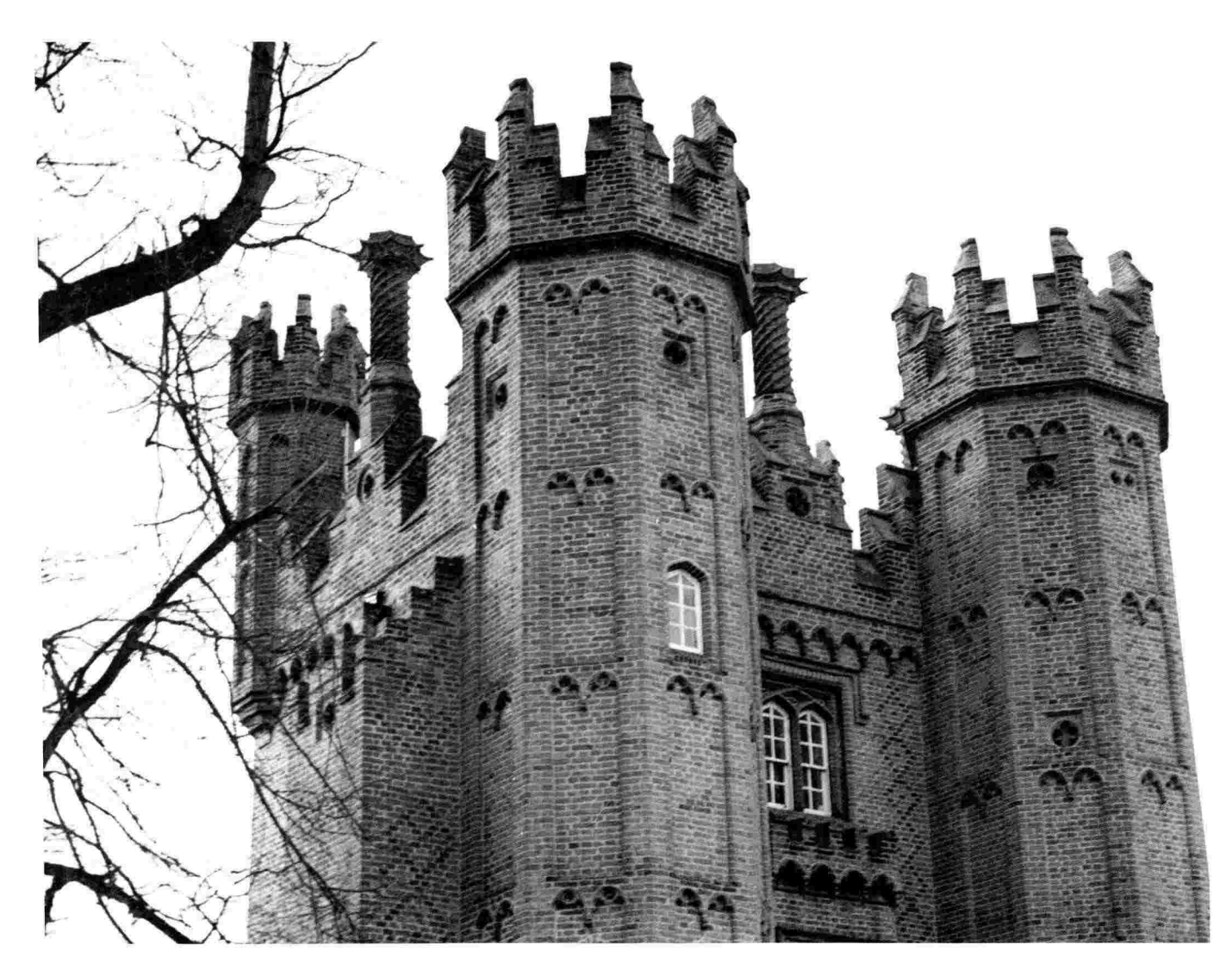
FIG. 1 – The turrets of Hadleigh Deanery from the north-west: the middle one is the dovecote.