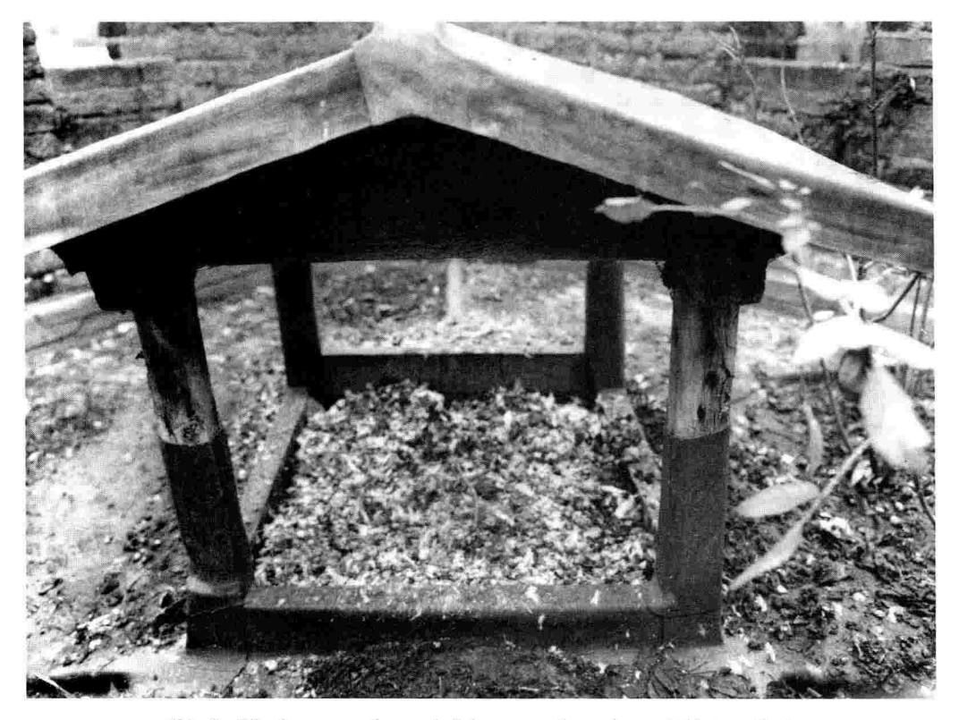
FIG. 6 – The louver on the roof of the turret, from the east.

had between 300 and 1,000 nest-holes; here there are only 93. To supply the large household of a castle or palace with a sufficient number of squabs a much larger dovecote would have been required elsewhere on the estate, to which this turret would have contributed only a small supplement.